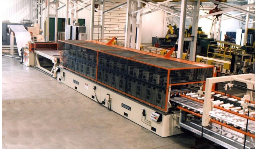
Figure 1: In-line Roll Former

According to ISO 14025, EN 15804 and ISO 21930:2017