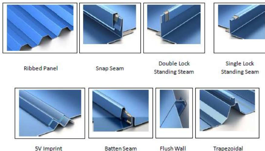
Figure 4: Types of roll forming profiles

Aluminum and steel coils can be formed into a variety of profiles and sizes depending on the need of the project, as seen in Figure 4.