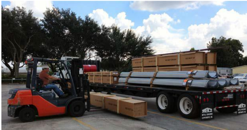
Figure 5: Packaging process for roll formed product

expanded polystyrene underlayment and wrapped in polyethylene film. Figure 5 shows an example of packaged roll formed product.