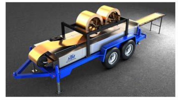
Figure 2: Mobile Roll Former

Figure 3 shows a detailed roll formed cladding manufacturing process.